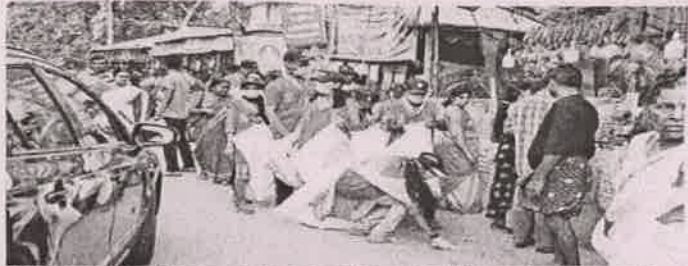
തിരുവൈരാണിക്കുളം ക്ഷേത്രത്തിൽ കുറുകുറ്റി എസ്സിഎംഎസ് കോളജിലെ എൻഎസ്എസ് വൊളന്റിയർമാർ വഴിയരികിലെ കാഫി സേവനം ചെയ്യുന്നു.

തിരുവൈരാണിക്കുളം പാർവതി ദേവിയുടെ 12 ദിവസത്തെ നടതുറപ്പ് ഉത്സവം നടക്കുന്ന മഹാദേവ ക്ഷേത്രത്തിൽ കുറുകുറ്റി എസ്സിഎംഎസ് കോളജിലെ എൻഎസ്എസ് വൊളന്റിയർമാരുടെ സേവനം ശ്രദ്ധ നേടുന്നു. ആണിക്യൂട്ടികളും പെൺക്യൂട്ടികളും ഉൾപ്പെടെ 130പേർ ക്ഷേത്ര പരിസരത്ത് ക്യാഫ് ചെയ്യുകയാണ്.